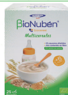
500g C.N: 193933.3