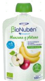
100g C.N: 193802.2