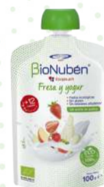
100g C.N: Próximo lanzamiento