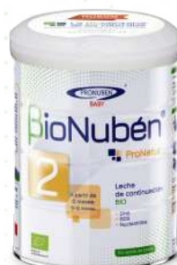
800g C.N: 193743.8