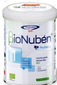
800g C.N: 193742.1