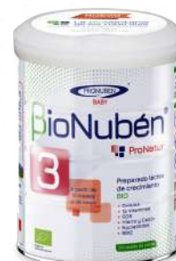
800g C.N: 193744.5