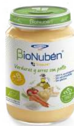
250g C.N: 193585.4