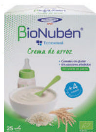
250g C.N: 193931.9