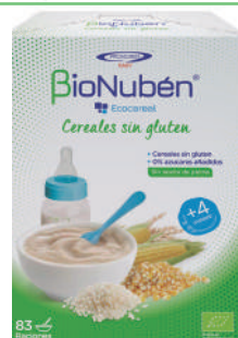
500g C.N: 193932.6