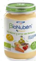
250g C.N: 193586.1