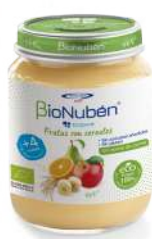
200g C.N: 193584.7