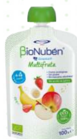
100g C.N: 193803.9