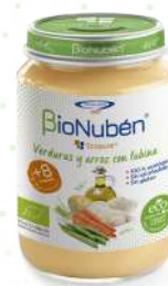
250g C.N: 193587.8