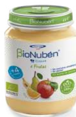
200g C.N: 193583.0